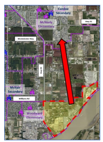
The proposed school boundary revision is east of Highway 99

The Richmond School District welcomes feedback on the proposed school boundary revisions. If you have any comments, please respond by November 15, 2019 by completing the online feedback form at <a href="https://bit.ly/2MiMwir">https://bit.ly/2MiMwir</a>. Written feedback can also be submitted to your school.