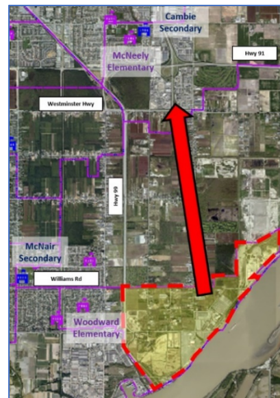
The proposed school boundary revision is east of Highway 99

The Richmond School District welcomes feedback on the proposed school boundary revisions. If you have any comments, please respond by November 15, 2019 by completing the online feedback form at https://bit.ly/2MiMwir . Written feedback can also be submitted to your school.